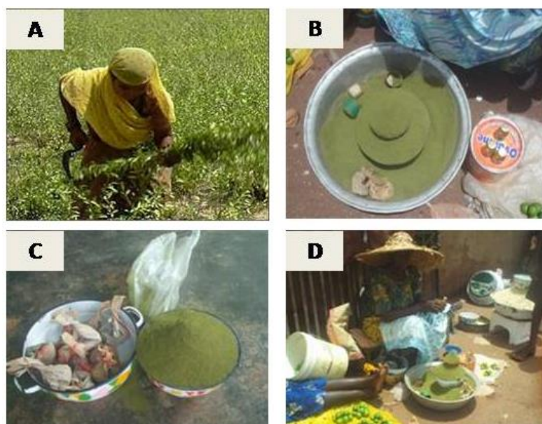
Figure 2. Pictures of henna production practice. A. Woman harvesting henna leaves B. Picture of Henna leaves powder after processing C. Packaged henna powder ready for sale D. Picture of a market woman engaged in the sale of henna powder.

pounding of the dried leaves and milling to obtain the green powder (Singh et al. , 2005). The extracted powder is then stored in polythene bags, jute sacks, plastic containers and stored in dried condition to prevent mould formation.